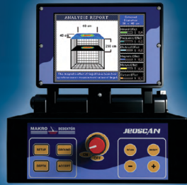
System (Control) Box