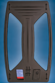
T100 Deep Search Coil