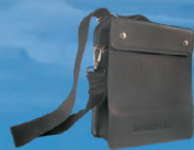
Leather carry bag for system box