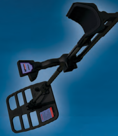
T44 Search Coil